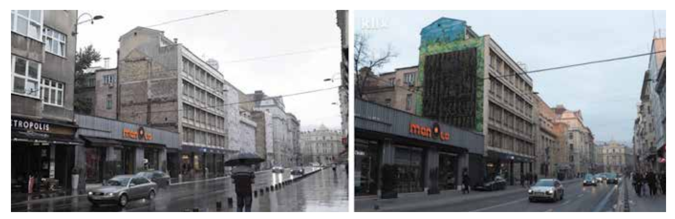
Figure 2. First green facade in B&H, before and after

structures that meet the needs of wider geographical areas, so that technological solutions often represent completely new VGS models, boasting highly advanced irrigation and maintenance systems.