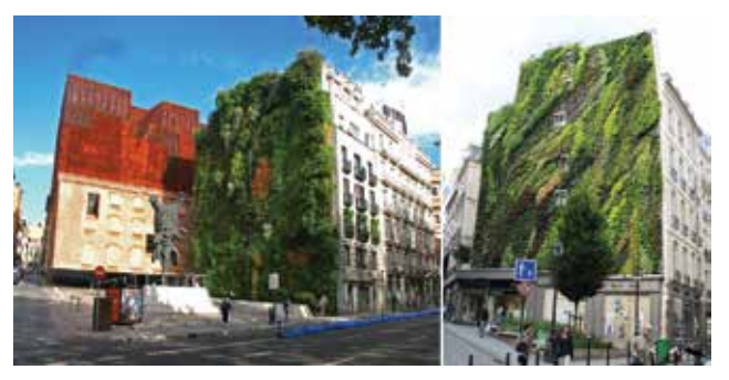
Figure 1. Caixa Forum Madrid and L"Oasis d"aboukir in Paris

Further research work in the vertical greenery system discipline, as well as new technological achievements, have largely contributed to the development of the VGS, which to this day has been a strategic element for the design and regeneration of urban environment. One of the most prominent examples of VGS implementation as a spatial benchmark of the urban matrix is the Caixa Forum Madrid, conceived by architects Jacques Herzog and Pierre de Meuron. They had the system implemented on a wall surface of 6,500 square meters using as many as 250 different plant species. In order to improve the quality of urban space through the process of placemaking, L"Oasis d"aboukir, designed by Patrick Blanca, was installed in Paris in 2013, as a specific diagonal pattern with over 237 different plant species (Figure 1).